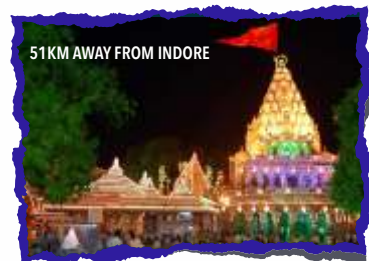
51KM AWAY FROM INDORE

The town fallen from heaven to bring heaven to earth", was how the famous Sanskrit poet Kalidasa had described the ancient city of Ujjain. Located at the heart of Madhya Pradesh, this ancient city is a labyrinth of bustling lanes that weave through temple clusters, earning Ujjain the moniker, "the city of temples".