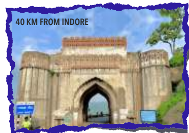
40 KM FROM INDORE

The Jam Gate is a picnic spot in Maheshwar Tehsil of Khargone District in the state of Madhya Pradesh, India. It is on Mhow-Mandleshwar Road. It was built by Rani Ahilyabai Holkar in 1791. It is approximately 30 km from Mhow, 50 km from Indore, 33 km from Maheshwar and 75 km from district headquarter Khargone.