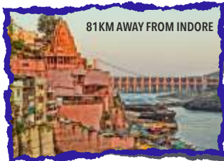
81KM AWAY FROM INDORE

Dedicated to Lord Shiva, the Omkareshwar temple is nestled in the Omkar mountain, an island in the middle of River Narmada. The temple has a large sabha mandap (prayer hall) standing on 60 brown huge stone pillars. The five storeys of the temple have different deities each and three prayer services are conducted in the temple everyday.