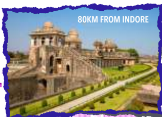
80KM FROM INDORE

Mandu is an ancient fort city in the central Indian state of Madhya Pradesh. It's surrounded by stone walls dotted with darwazas (gateways). It's also known for its Afghan architectural heritage. Landmark buildings include Hoshang Shah's Tomb, a domed marble mausoleum, and the vast Jami Masjid mosque, with courtyards framed by colonnades. The imposing, centuries-old Jahaz Mahal palace stands between 2 lakes.