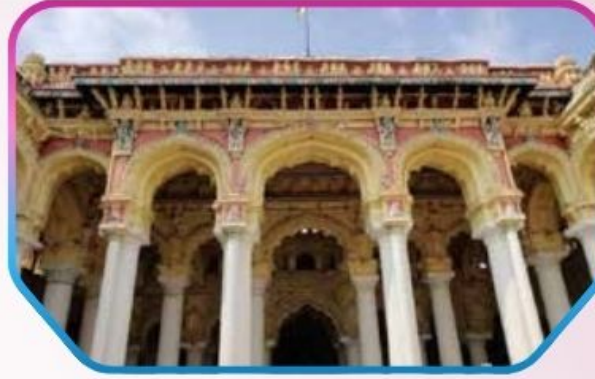
Thirumalai Nayakar Mahal