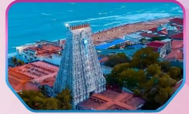
Tiruchendur temple & Beach