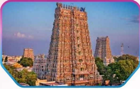
Meenakshi Amman Temple