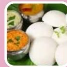
Malli Poo Idli