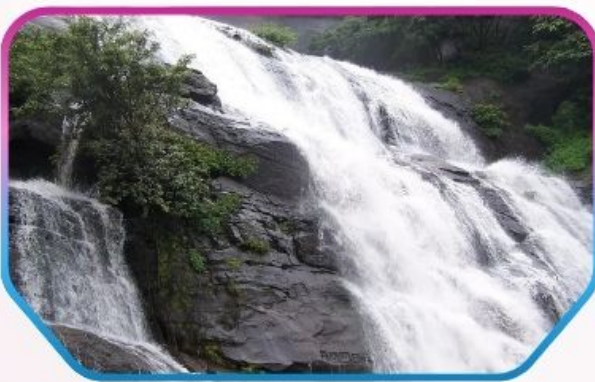
Courtallam Water Falls